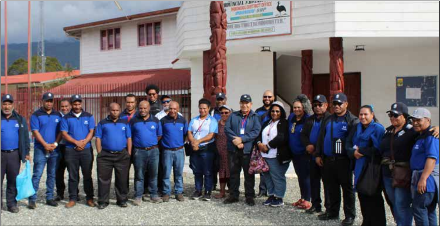
MVIL Board Members, Senior Management and staff posing in front of the Walume Provincial Administration Building after the site inspection.

T he Motor Vehicles Insurance Limited (MVIL) is expected to open a new state-of-the-art office facility at Walume in Imbonggu District of Southern Highlands, later this year.