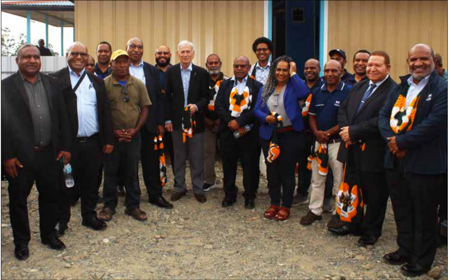
The MVIL Board of Directors and Management Team with the Jiwaka Provincial Administrator in front of the building that will house MVIL's Jiwaka Customer Service Centre in Minj Town. The Jiwaka Customer Service Centre was relocated from Kurumul to Minj Town.

T he Motor Vehicles Insurance Limited's (MVIL) Jiwaka Customer Service Centre in Kurumul has been relocated to Minj Town.