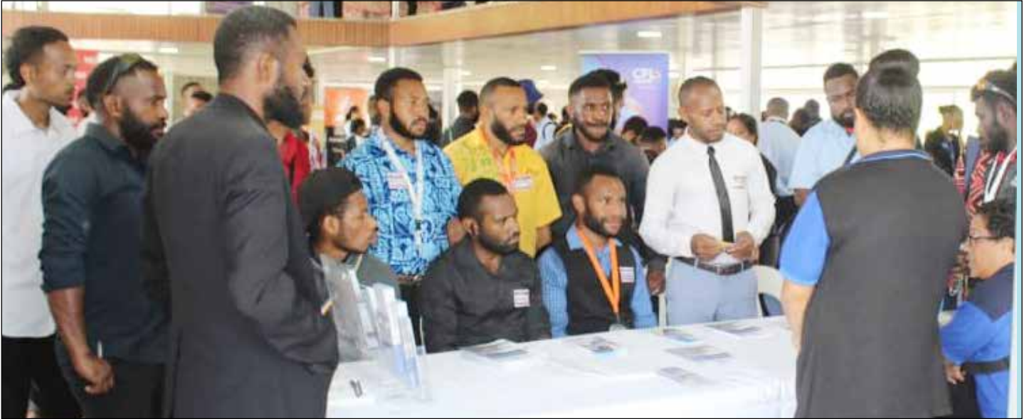
PAU students gathered around to listen to MVIL staff representatives explain the core functions of the company and the services provided.

Students from the Pacific Adventist University (PAU) showed keen interest in Motor Vehicles Insurance Limited (MVIL) as a potential employer after graduating during the university's career day.