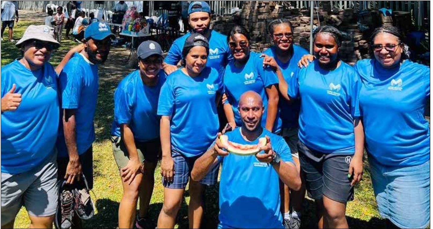
MVIL staff with family members (above and below) that took part in the Corporate Health Challenge at the IEA TAFE College in Port Moresby.

A team of 15 enthusiastic participants from Motor Vehicles Insurance Limited (MVIL) took part in the 2024 Corporate Health Challenge.